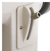
REVERSE LEVER MECHANISM