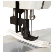
UP TO 8 LAYERS OF SUNBRELLA-PLUS