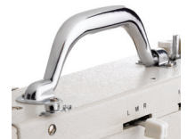
HEAVY-DUTY CARRYING HANDLE