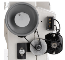
BUILT-IN SPEED REDUCER