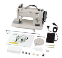
FULL ACCESSORY KIT